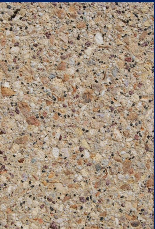
Visit us at: www.willisconstruction.com